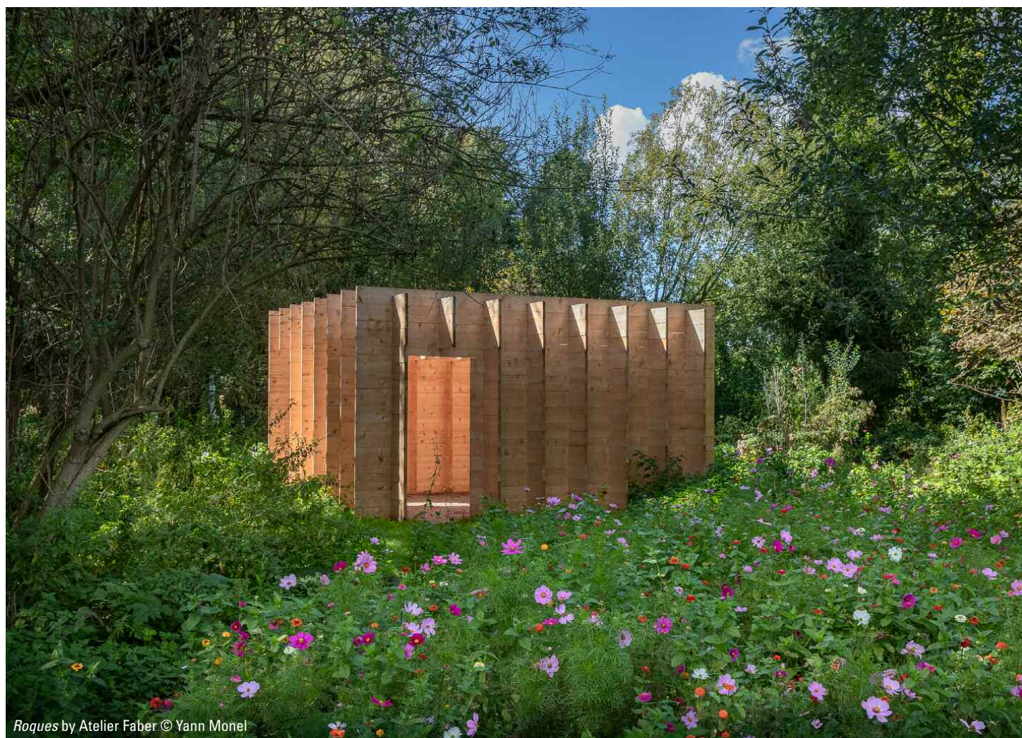
Roques by Atelier Faber © Yann Monel

File to be submitted before 22 nd December 2020