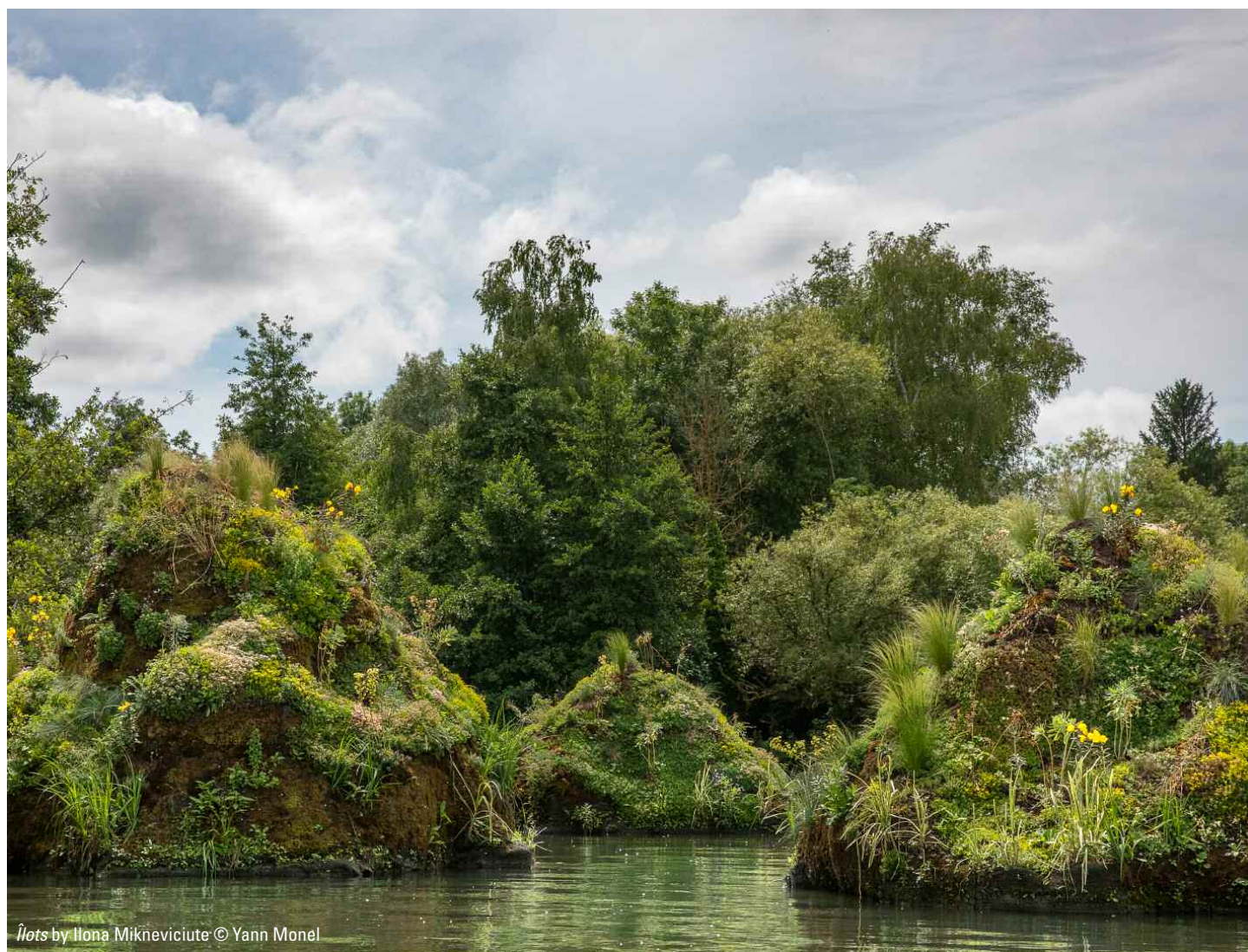
Îlots by Ilona Miknevičiute

Application deadline: the 3 rd January 2022 (11:59 pm, French time)