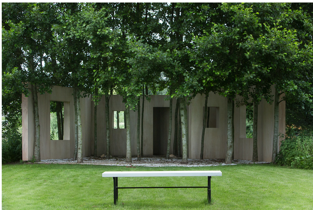
La chambre des lisières © Solène Ortoli