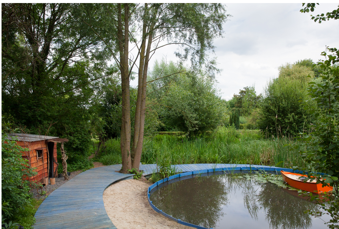
Water has many voices

Below is a photo of a previous garden in the same location.